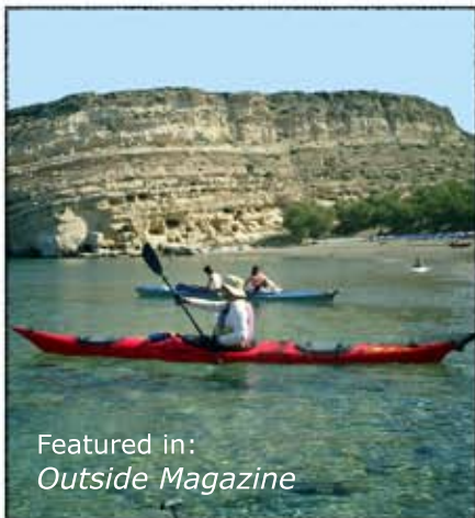
Featured in: Outside Magazine

Each day of paddling provides opportunities for cappuccino stops at seaside tavernas, cliff jumping and exploration. On day 4, we paddle from the shore of Agia Roumeli to Loutro, making planned stops to visit ancient chapels and sea caves that dot the shore. From the charming, roadless seaside community of Loutro, where we will spend two wonderful nights, we will guide our kayaks to Hora Sfakia for lunch and then on to Frangokastello, a Venetian Fortress town. Our final days of kayaking take us along the rugged coastline of Plakias, and on to Agia Galini, an idyllic and romantic fishing community. After breakfast on day 8 we will return to Matala, either by paddling across the bay or by van.