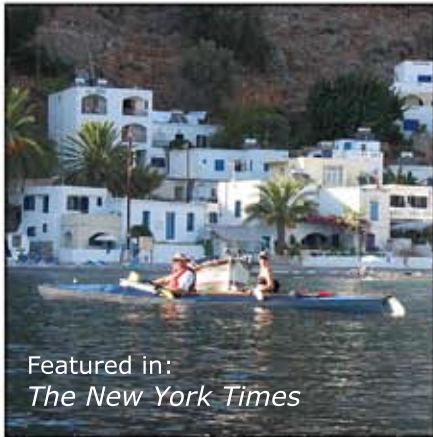
Featured in: The New York Times

The Northwest Passage - 800.732.7328 - www.nwpassage.com